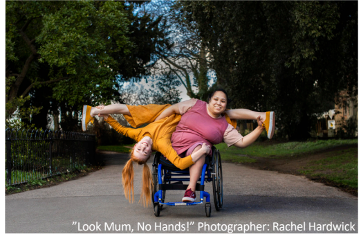
"Look Mum, No Hands!"