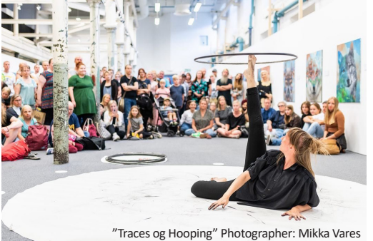
"Traces og Hooping"