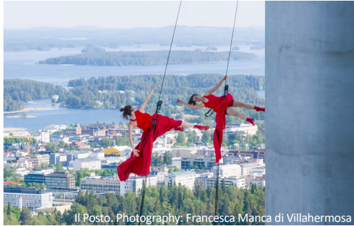
Il Posto. Photography: Francesca Manca di Villahermosa