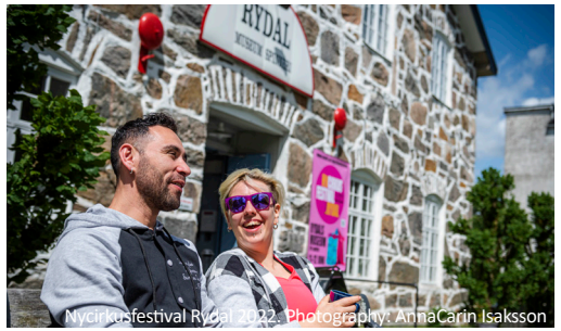
Nycirkusfestival Rydal 2022.